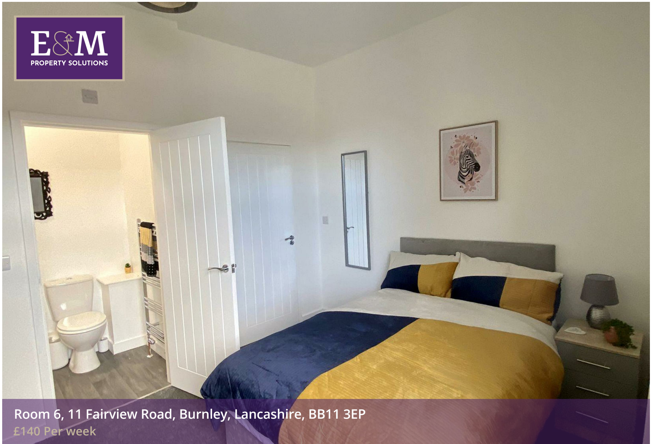
Room 6, 11 Fairview Road, Burnley, Lancashire, BB11 3EP £140 Per week